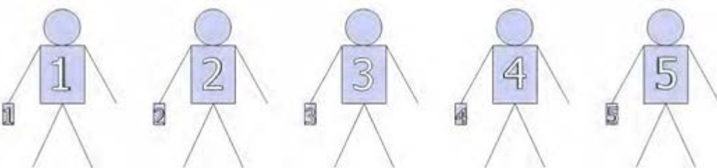
Some of the natural number guests at Hilbert's hotel

It seems nice. You notice a very big group of alien looking creatures. Each wears a number on its chest, almost like a nametag, and holds in their hand a small card which is similarly numbered. They look the creatures below.